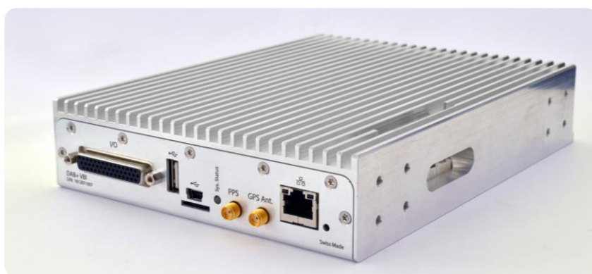
Our compact, fully integrated FM Voice Break-In module. Multi-ensemble processing, IP connection, low power consumption and a robust, RF safe casing are just some of the features we offer.

Our dedicated RF frontends in conjunction with the high speed analog to digital converters, allows to cover the whole FM broadcast band at the full bandwidth of 20.5 MHz with processing capabilities of up to 32 programs on a single hardware unit.