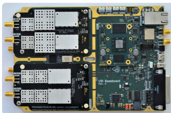
Modular, broadband RF Interfaces (up to 150MHz RX- and 600MHz TX-bandwidth) make our system ready for you customized frequency needs. Contact us with your specifications.