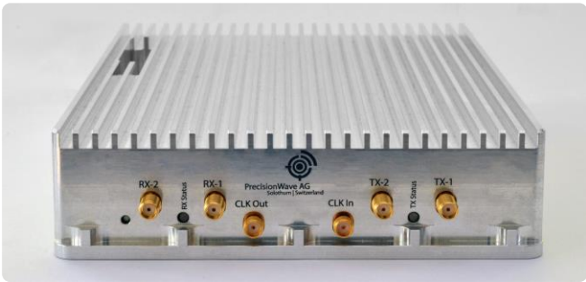
RF Interface at the module: dual RF-input, clocking and dual RF-output. E.g. our hardware also allows the independent operation of two tunnel tubes.